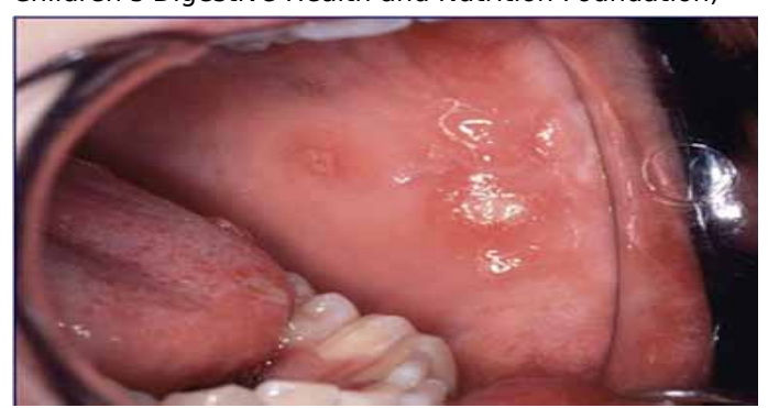
Aphthous ulcers in the buccal mucosa